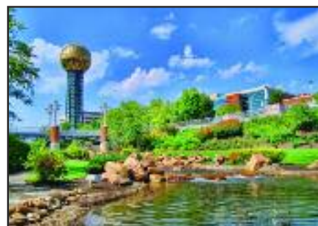
Worlds Fair Park