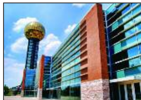
Knoxville Convention Center